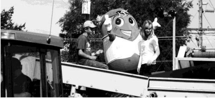
Rosso Bambino in the "Dig This" Potato Festival parade - Merrill,

R osso Bambino is the new OPC mascot that delivers a message for more than 120 commercial potato farms in Oregon that produce 2 billion pounds of potatoes each year.